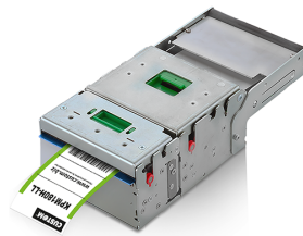
915AH021000700 PRINTER KPM180H RFID UHF ETH USB RS232 CUT AVIATION

Via Berettine, 2 - 43010 Fontevivo PR - VAT: IT02498250345 - TEL: +39 0521 680111 - FAX: +39 0521 610701 - UNIQUE CODE: 8RQN7AZ