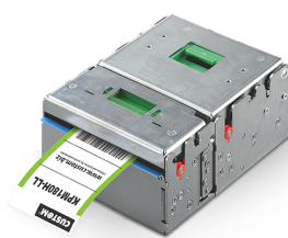
915AH021300700 PRINTER KPM180H CUT ETH USB RS232 AVIATION